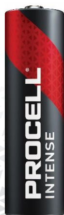
Size: AA (LR6) PX1500